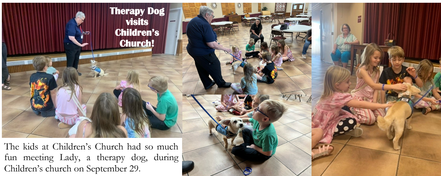
The kids at Children's Church had so much fun meeting Lady, a therapy dog, during Children's church on September 29.